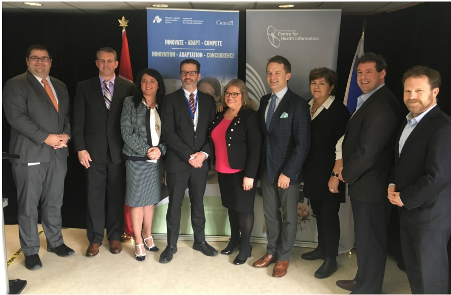
ACOA Announcement –the Centre was pleased to welcome representatives from the Federal and Provincial Governments.