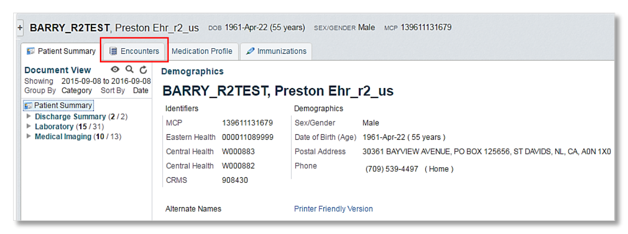
Figure 1: Screen showing "Encounters" tab

Patient Encounters are a component of the Dynamic Summary in HEALTHe NL and can be accessed by clicking on the "Encounters" tab next to the "Patient Summary" Tab (Figure 1).